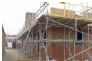
Work in Progress: How readers last saw it.

English and I.T. are some that have benefited.