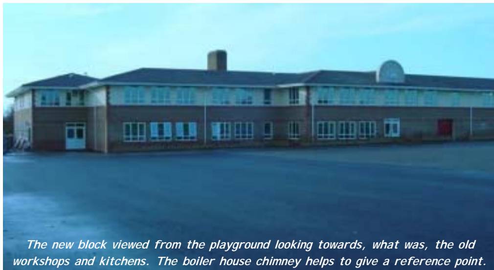
The new block viewed from the playground looking towards, what was, the old workshops and kitchens. The boiler house chimney helps to give a reference point.

The advent of the new building has of course meant that we have been able to refurbish and extend existing departments within the school: Geography, History, the Special Needs department,