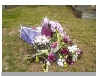
Back home in Luddenden, W Yorks

He will be sadly missed by so many people but, as he was fond of saying, "Omnia mutantur et nos mutamor in illis" – All things change and we must change with them!