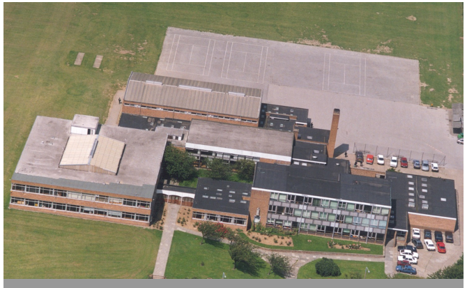
Aerial view from the mid-1970s to late 1980s

The very subjects on offer would baffle and astound many of those in the 1960 intake. ICT and Media Studies would have sounded