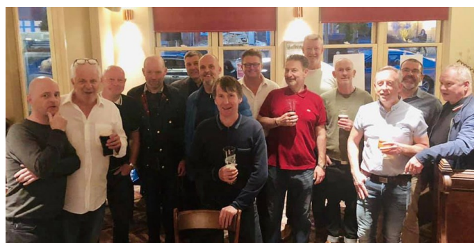
The 1979 leavers looking a little more mature—Take 1...

Last year saw an interest in renewing friendships amongst those who left STM both in 1979, who were experiencing their "40 years on" moment, and those from 1980 who were fast approaching the same milestone.