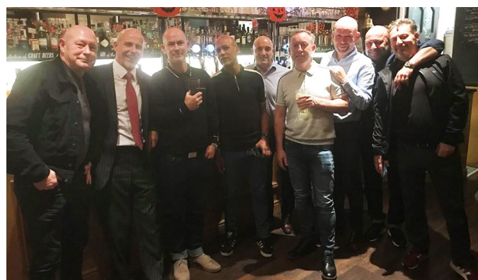
...and Take 2. But where's all the hair gone?

Both groups have set-up Facebook sites and anyone interested in learning more can be put in touch with them by simply contacting the Alumni email address on the front page.