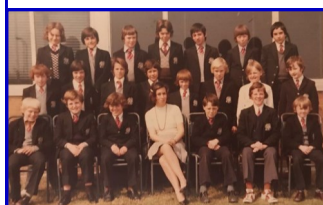
The 1979 leavers as 1st Years in 1974 and their cricket team