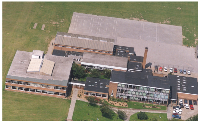
Aerial view from the mid-1970s to late 1980s

The very subjects on offer would baffle and astound many of those in the 1960 intake. ICT and Media Studies would have sounded