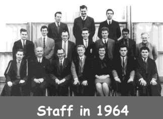
Staff in 1964

However it's not only the buildings that have changed beyond all recognition over the 50 years since the first pupils were welcomed in.