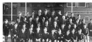
St George's - 1960

Woodwork and Metalwork (and Plastics plus, no doubt, an assortment of other materials) — the very titles of the year groups have all "gone decimal". Where us dinosaurs used to refer sneeringly to "First Years" today's old-hands laugh at Year 7s. Prefects are now Year 11s and those staying on for the maximum "sentence" are no longer in the Upper 6th, but are, instead, in Year 13. Of course esteemed