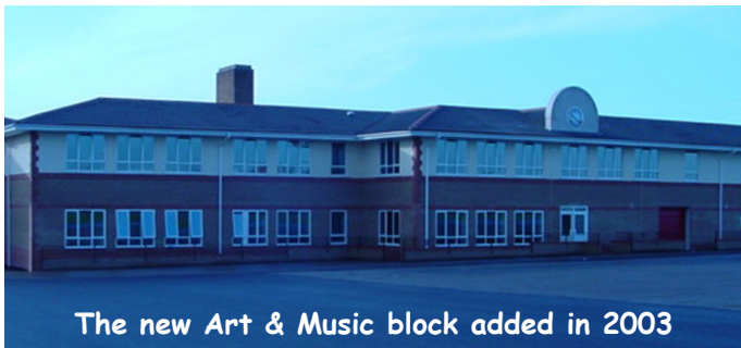
The new Art & Music block added in 2003

High boys playing rugby on their fields), the opportunities to excel nowadays are fairly exhaustive. And excel they do!